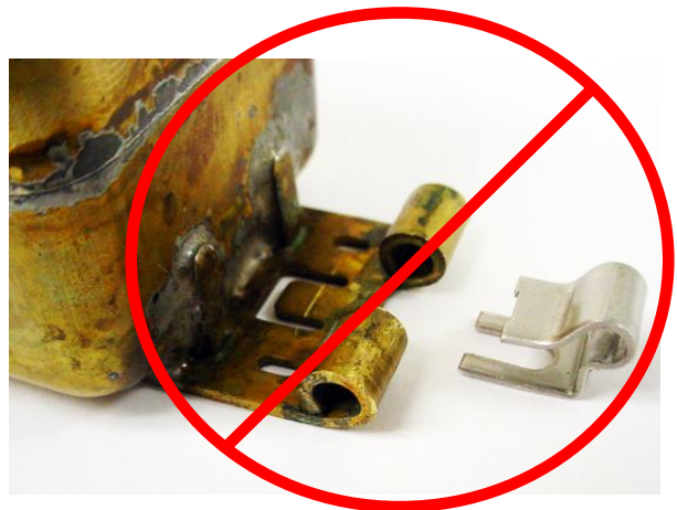
PHOTO 2 DO NOT USE THIS COMBINATION 29-182 EXEMPLAR CLIP SHOWN. AV29-182 IS SIMILAR