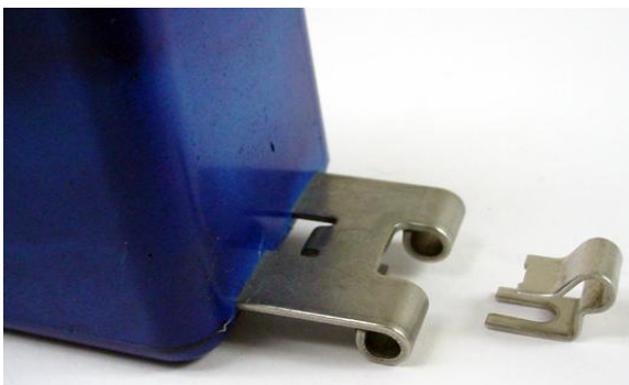
PHOTO 3 30-862 FLOAT AND 29-182 CLIP CORRECT COMBINATION NOTE: DIFFERENCE IN FRAME GEOMETRY