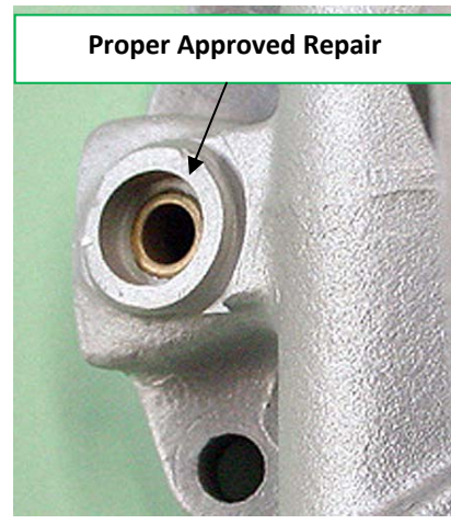
Figure 3: Proper Bushed Repair